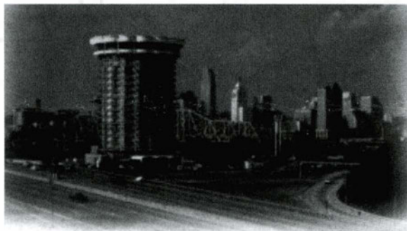
THE RADISSON AT COVINGTON It's A Hotel In The Round