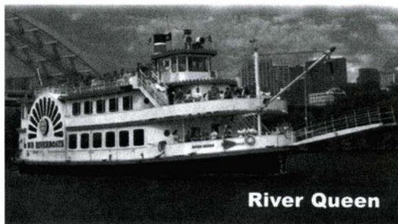
THE RIVER QUEEN ON THE OHIO Reunion Begins With A Dinner Cruise